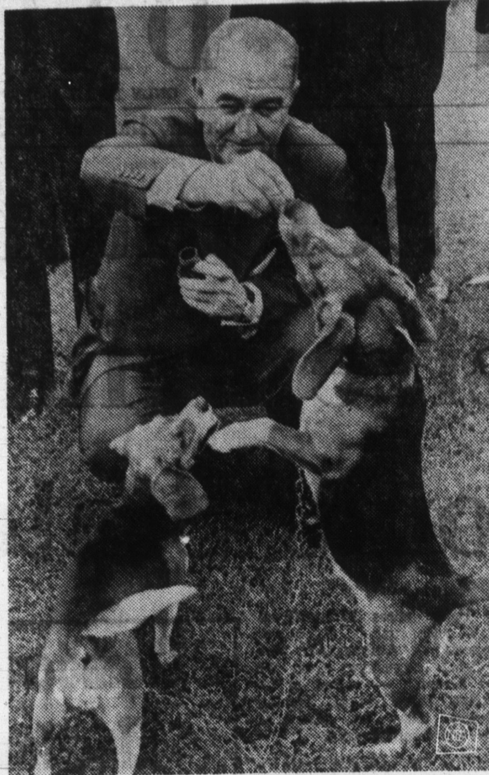
TOP DOGS —President Johnson showed off the family's two pet beagles to news cameramen on the lawn outside the White House. The Chicago Humane Society took a dim view of the President's action during the session when he pulled the animals up by their ears. "It's good for them," he said. The Chicago Society disagreed.

Call Pleasant Mills 7-7414 or 7-7425 For Reservations.