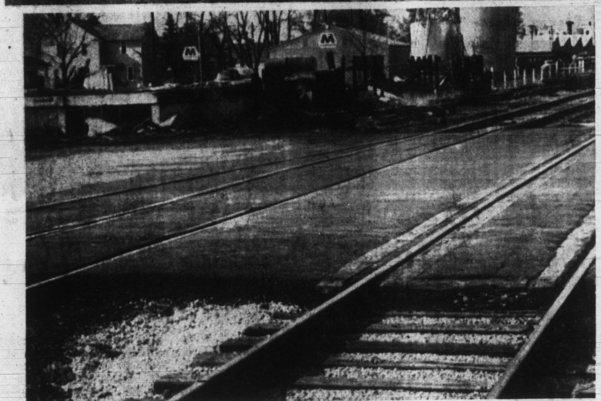
CROSSING REPAIRED — Pictured above are two views of the Monroe street crossing of the Pennsylvania railroad, which was opened to traffic Friday following extensive repairs.