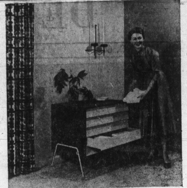
Extra table linens and silverware are protected, but quickly available, in this good-looking buffet storage chest. You can build it yourself with a free plan available from Douglas Fir Plywood Association, Tacoma 2, Washington. It's not difficult to build, although power tools simplify the bevel and angle cutting.

Window & Awning Co. 711 Winchester St. Phone 3-2259