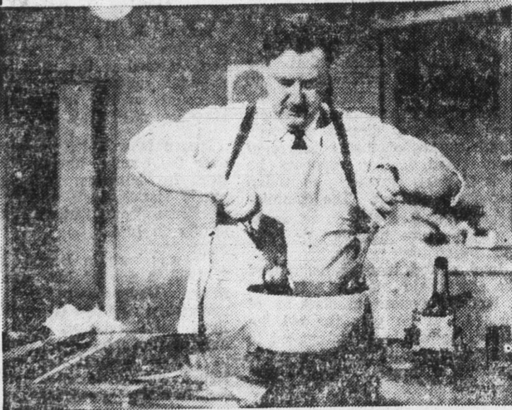
NEXT TO A NEW ELECTRIC RANGE, the best kitchen helper a woman can have is a husband who can cook. And the best way to encourage him to learn is to make it easy, as this built-in electric range does. Walter Slezak, TV, stage and screen star — and gourmet cook — is shown stirring up a hearty Hungarian goulash in a two-listed male manner. A thermostat control will permit long, slow simmering without worrisome watching.