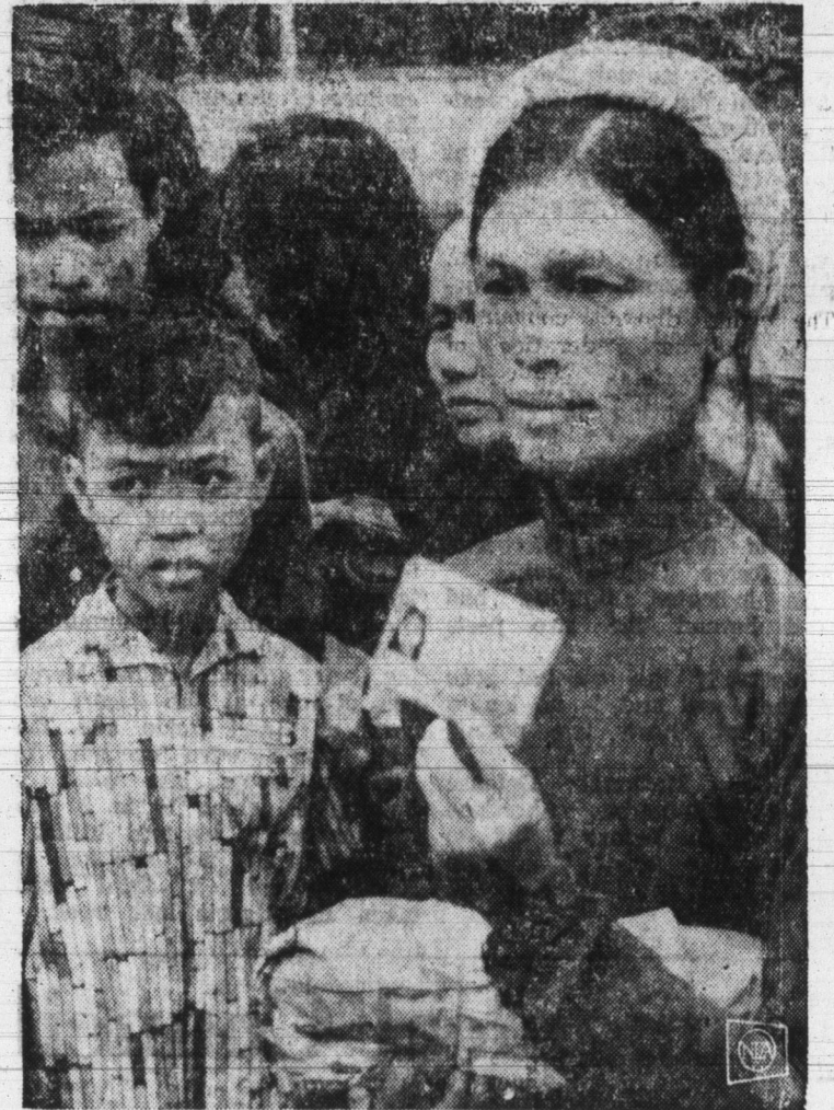
WAITING — Mother, waiting for her daughter's release from police headquarters in Saigon, displays the young woman's identification card. The girl was among hundreds arrested in students' antigovernment demonstrations.

This is the first quarterly dividend of the current fiscal year and represents a continuation of the company's record of cash dividends, which has been uninterrupted since 1942.