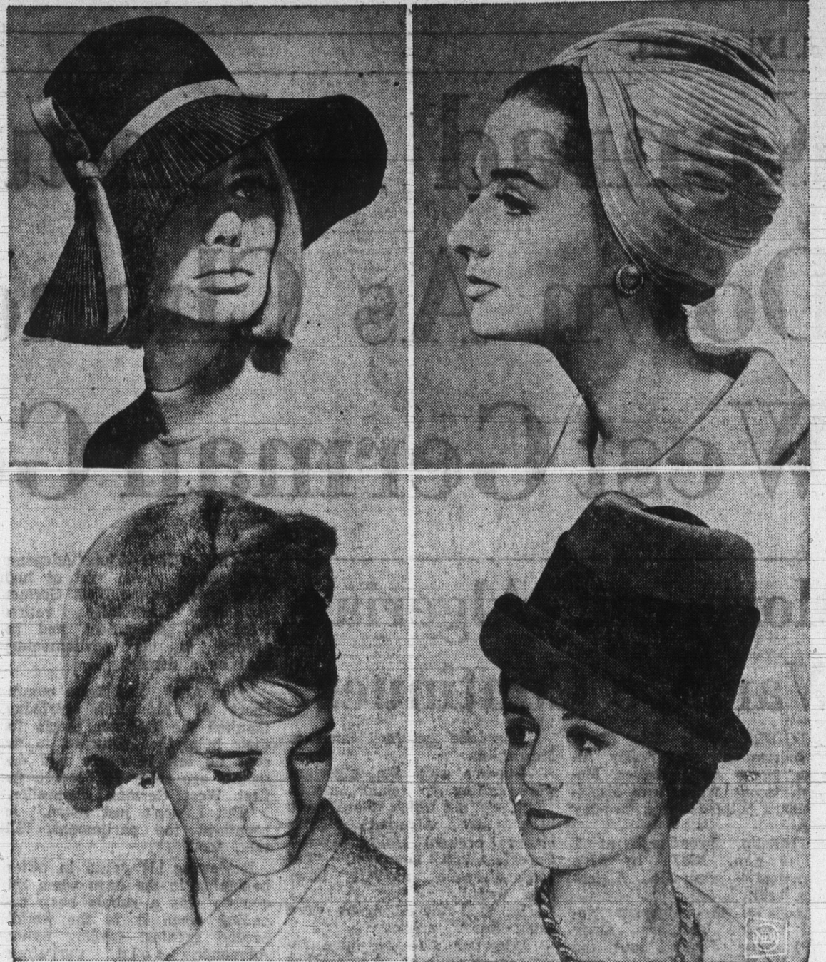
The new smooth hairdos have brought hats back to the fashion scene. Black antelope swag hat (top left) by Emme, is banded with ginger capeskin. Draped velvet turban in gray and camel (top right), is worn toward the back of the head. The beret gains a new impetus (lower left) in this forward sloping shape done in gray squirrel. Tilt-brim fedora (lower right) is in turquoise velour, accented with black velvet. These are Vincent Harmik designs.