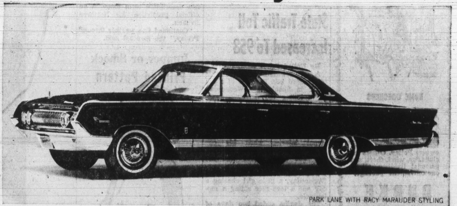
PARK LANE WITH RACY MARAUDER STYLING

For '64: the price is medium... the action maximum... the car is Mercury