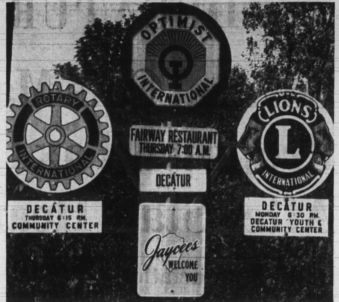
ONE OF THE NEW SIGNS which carries the insignia of the local Rotary, Lions, Optimists and Jaycees organizations is pictured above. The sign above is located south of Decatur on U. S. 27. Four identical signs have been erected north on U. S. 27, east and west on U. S. 224, and south on U. S. 33.

Since the program was initiated by the Hartford Insurance group in 1947, it has enlisted more than 35 million school children in the cause of fire prevention and safety.