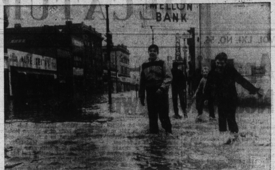
NO FUN FOR CITY FATHERS—Boys gleefully wade across the main intersection of Carnegie, Pa. Most of the community was inundated by the overflow of Chartiers Creek.

The film is part of a special missionary emphasis currently in progress at the church. The public is invited.