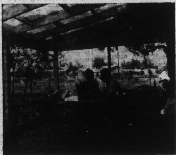
An ideal warm weather home improvement project is an outdoor room. With Fiberglass screened walls and a Sun-shade panel roof the home owner has a room that is attractive to the eye and virtually maintenance-free.

New building materials, designed especially for use with outdoor rooms, are attractive to the eye and virtually maintenance-free. They can easily be used by the home handyman as well as the professional. Fiberglass screening for enclosing the walls is available in 34" widths to provide seamless bug protection. It is made of vinyl-coated fibrous glass yarns and will not rust, stain, corrode, or dent. It is fire-safe and is guaranteed for ten years by Owens-Corning, the manufacturer. Translucent, lightweight, shatter-proof Fiberglass-reinforced plastic panels provide perfect outdoor living room roofs. The color is permanently embedded in the plastic which can be easily sawed, nailed, drilled, screwed or bolted.