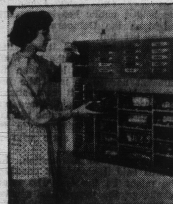
"Kitchen of Tomorrow" with automatic push-button control.