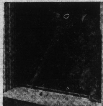
A stainless steel threshold which will last the life of the house has been placed on the market by United Industries, Inc.

Your main objective is to plant a pleasing picture. Take care in the planting, standing off at a distance and observing it to get the effects you wish.