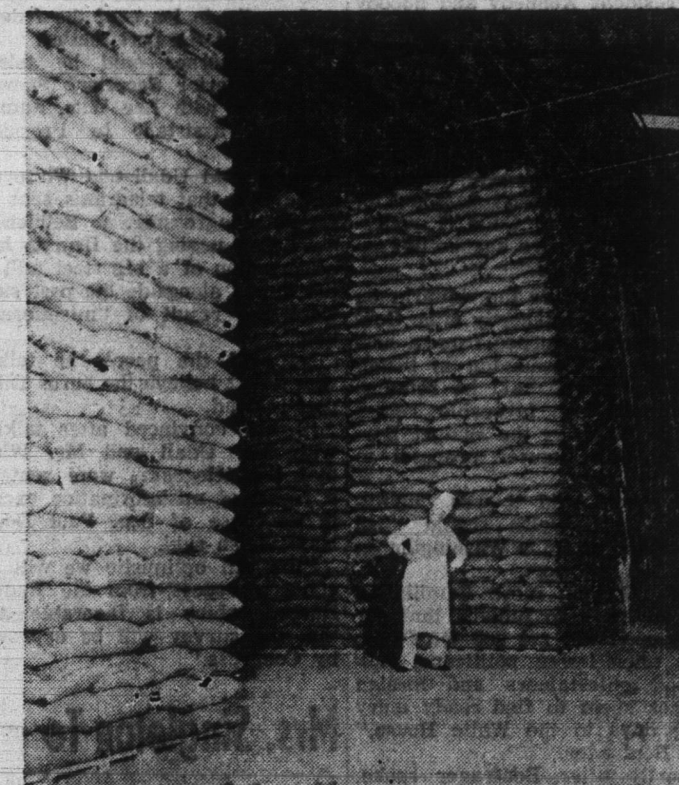
RICE SUPPLY AND DISTRIBUTION

The speedy leatherneck entered the Marine Corps in November 1960, after graduating from Purdue University at Lafayette, Ind.