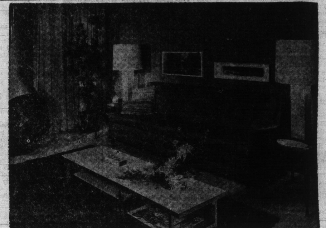
NATURAL BACKGROUND for a contemporary living room is furnished by the warm glow of hard-board panels pre-finished in random grooved wood grained finish. A wide choice of such finishes is available.