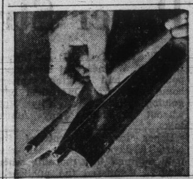
Cross-section of new stainless steel threshold shows the self-locking vinyl seal which snaps into retaining channels and is instantly replaceable without removing the threshold.

SASH AND TRIM FIRST It's a good idea where possible to paint the outside window sash and trim with your chosen trim paint or exterior enamel before painting the rest of the house. In this way you avoid placing the ladder against the newly painted siding.