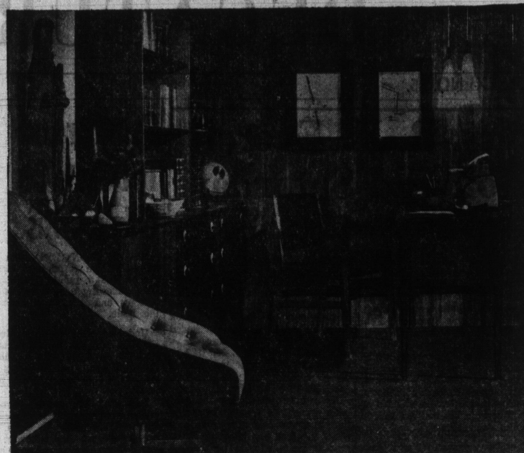
Tight-looped, tweedy carpet underscores a home office area—a perfect spot for the man of the house to catch up on extra work or for a homemaker to cope with the budget. This durable carpet texture has proved its worth in large commercial installation and is now seen in new stylings for residential use. It is seen this year in bright shades such as turquoise, red or gold.