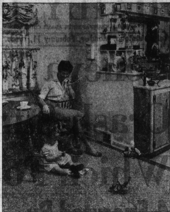
Children can play in comfort and safety, and a family dining area is quieter and more attractive with a room-size rug on the floor. This practical, tweedy style requires little maintenance. Since it is cut to fit the room, but is not installed, it can be turned to equalize wear in the passage areas from living room to dining room to the adjoining kitchen. The style is versatile in decor.

SEAL THE KNOTS To prevent the resin in knots from staining the paint on your house, be sure to seal the knots. Best results will be obtained by using a specially formulated knot sealer, but satisfactory sealing