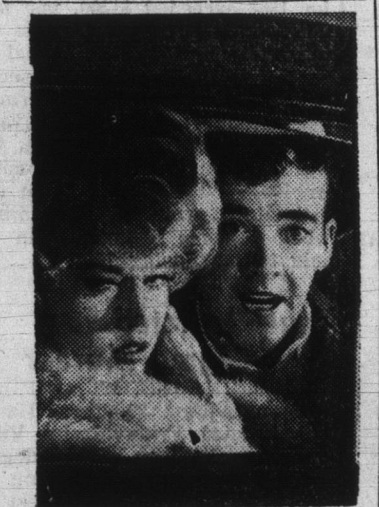
Jane Fonda and Jim Hutton portray the newlyweds in "Period of Adjustment," the laugh-packed attraction showing Sunday and Monday at the Adams theater. Tony Franciosa is also starred in the first comedy written by the famous playwright, Tennessee Williams.

"The rule of law touching reasonable doubt is a practicable rule, intended to guide practicable judges and courts, when engaged in the serious and important duty of administering justice. There is nothing in it that is mysterious or fanciful. It does not furnish a shield for those actually guilty, whereby to escape merited punishment."