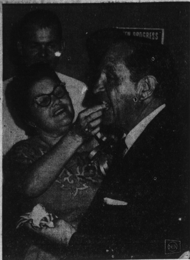
IT'S FIVE FOR FAUBUS —Arkansas Gov. Orval E. Faubus tastes victory cake given him by his wife in Little Rock. Faubus defeated five opponents to win nomination for an unprecedented fifth term as governor.