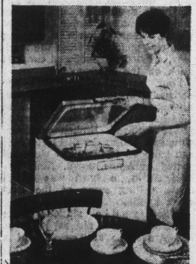
Portable electric dishwasher saves steps as well as time.

A dishwasher that goes to the table saves many a step. Portable electric dishwashers like the one above can be rolled easily to the dining table when dinner's over, to be loaded and rolled to the sink for the automatic washing operation.