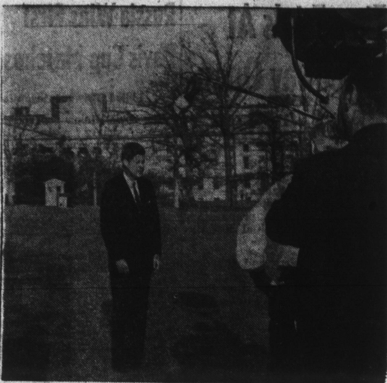
PRESIDENT KENNEDY poses on White House lawn for his part in the film, "Youth Physical Fitness—A Report to the Nation," available for showing to schools, community organizations and for local television stations.

WASHINGTON (UPI) — The United States set off a low-yield underground nuclear blast Monday at its Nevada test site. It was the 31st announced test since the underground series began last fall.