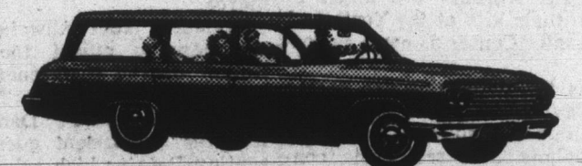
NEW BEL AIR 4-DOOR STATION WAGON

You won't find a vacation-brightening variety like this anywhere else. And now that spring has sprung, the buys are just as tempting as the weather. Your choice of 11 new-size Chevy II models. Fourteen spacious, spirited Jet-smooth Chevrolets. And a nifty, nimble crew of rear-engine Corvairs. Three complete lines of cars—and we mean complete—to cover just about any kind of going you could have in mind. And all under one roof, too! You just won't find better pickings in size, sizzle and savings anywhere under the sun. And you couldn't pick a better time than now—during your Chevrolet dealer's Fun and Sun Days.