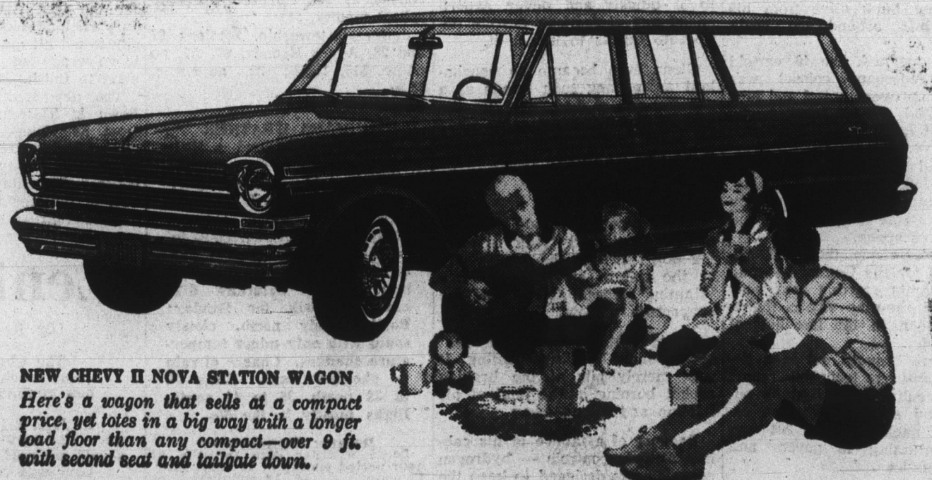
NEW CHEVY II NOVA STATION WAGON

From snappy interiors to sure-footed seat, this one's got the gift of making sport of most any trip.