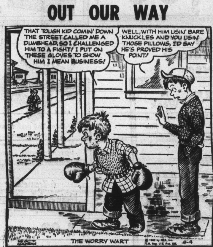
THE WORRY WART

MONROE—Phone 6-6866 — 0 — BULMAHN FARM SUPPLY DECATUR—Phone 3-9106