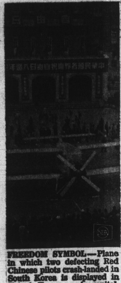
FREEDOM SYMBOL — Plane in which two defecting Red Chinese pilots crash-landed in South Korea is displayed in Taipei, Formosa's capital.

One woman was hospitalized for observation and the others were released after a check. A company spokesman said the women were taken to the hospital as a "precautionary measure."