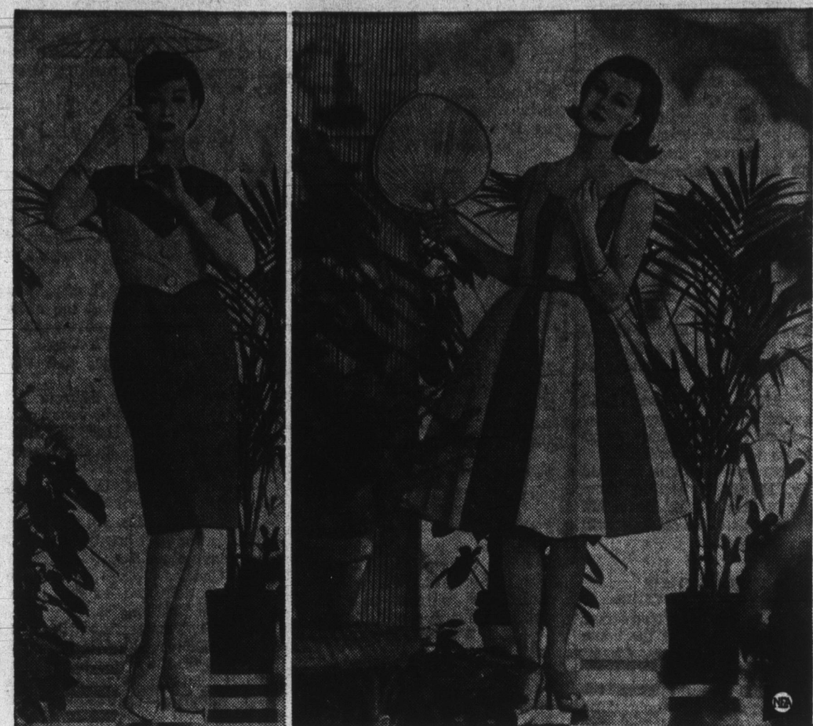
Linen gets special treatment in these designs by Ellette of California. Slim dress (left) is done in colors of green, olive and yellow with color inserts through the midriff. Wide-skirted dress (right) is done with tank top and wide stripes of raspberry, beige and apricot.