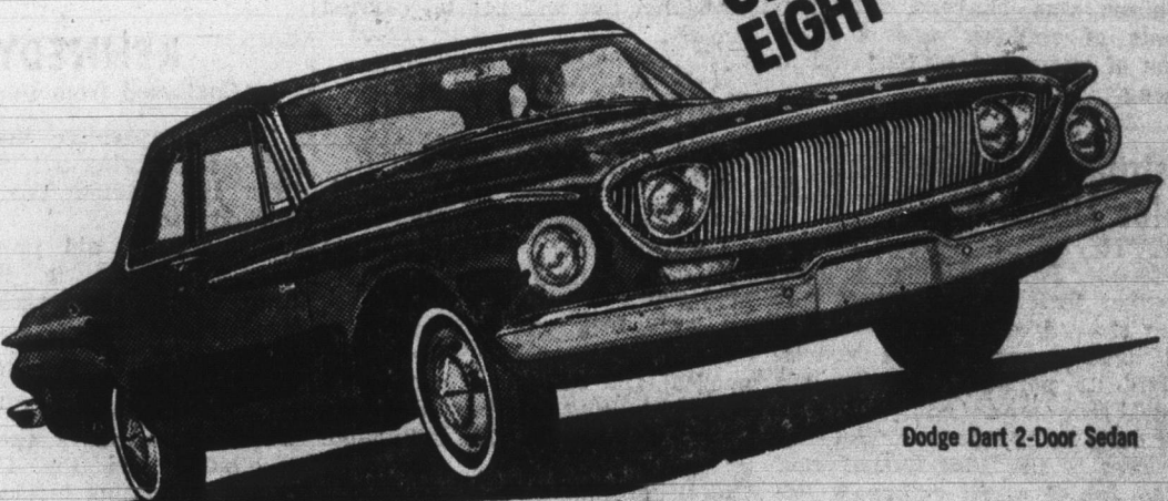
Dodge Dart 2-Door Sedan

remember, this is the same six that got better than 23 miles to the gallon in last year's Mobilgas Economy Run. Frankly, we don't think anybody but a pro can get this kind of mileage. But it does give you an idea of the engine's potential. Repeated tests in the new size Dart prove that it will deliver at least 6% better gas economy than last year. See your Dodge Dealer now and drive the new size Dodge Dart. There's no better value on the market today.