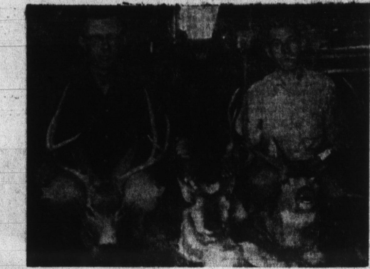
DICK FEASEL AND WILLIAM CALLOW show several of the large antelope and deer that they brought back from a week's hunting trip in northcentral Wyoming, near the South Dakota border. They saw more than 300 antelope during the trip.