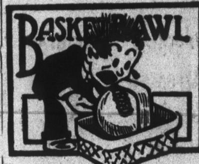
Greetings of the season!

Colorado 7, Oklahoma 0. Washington 7, Oregon 6. Southern California 21, Stanford 6. California 14, Oregon State 6.