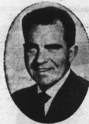
RICHARD M. NIXON for President