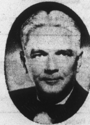
CRAWFORD F. PARKER for Governor

★ Recent Republican Administrations have accomplished the greatest road program in Indiana history . . . 5,000 miles resurfaced, 1,500 miles of new roads, in all 92 counties. Indiana has risen from 46th place to rank among the top 10 states in road building.