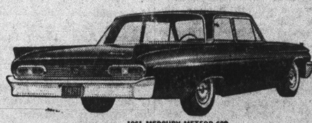
1961 MERCURY METEOR 800

Priced to compete with the low-price field! MERCURY METEOR 600 and 800 series