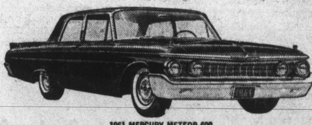
1961 MERCURY METEOR 600

Announcing a new and better kind of low-price car