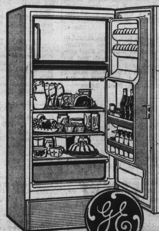
11-cubic-foot Model BA-11T

FAMOUS STRAIGHT-LINE DESIGN Needs no door clearance at side