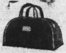
CANVAS UTILITY AND GYM BAG

Made of heavy rubberized, waterproof fabric. Giant 18" size bag. Sturdy bottom. Heavy duty zippers with pull tabs at each end. Ideal for gym clothes, travel, beach, and sports. Spring wire frame keeps bag in original shape.