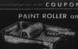
PAINT ROLLER and TRAY SET