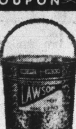
10-QT. GALVANIZE PAIL

Guaranteed rust and leak proof. Replace your damaged pail now at this low price. Correct size for most oil, paint, and other uses.