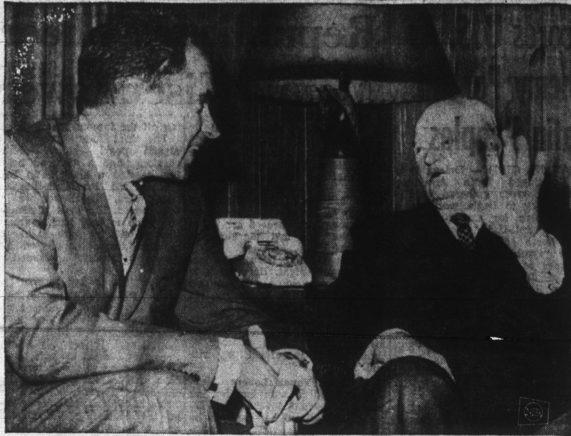
MR. REPUBLICANS, YOUNG AND OLD—Vice President Richard M. Nixon talks with former President Herbert Hoover in a Chicago hotel.

"Kidnaped" Tuesday & Wednesday at 8:35 p.m. "13 Fighting Men" at 10 p.m.