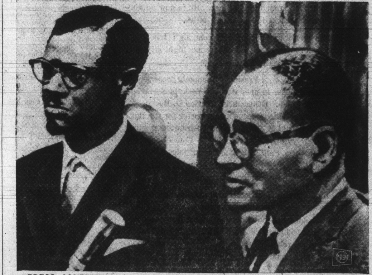
PRESS CONFERENCE—Congolese Premier Patrice Lumumba, left, standing beside U.N. representative Dr. Ralph Bunche, talks to newsmen in Leopoldville.