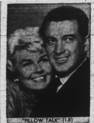
"Pillow Talk" (1-8)

Coming Wed.—"Decatur 1960" See Yourself in the Movies!