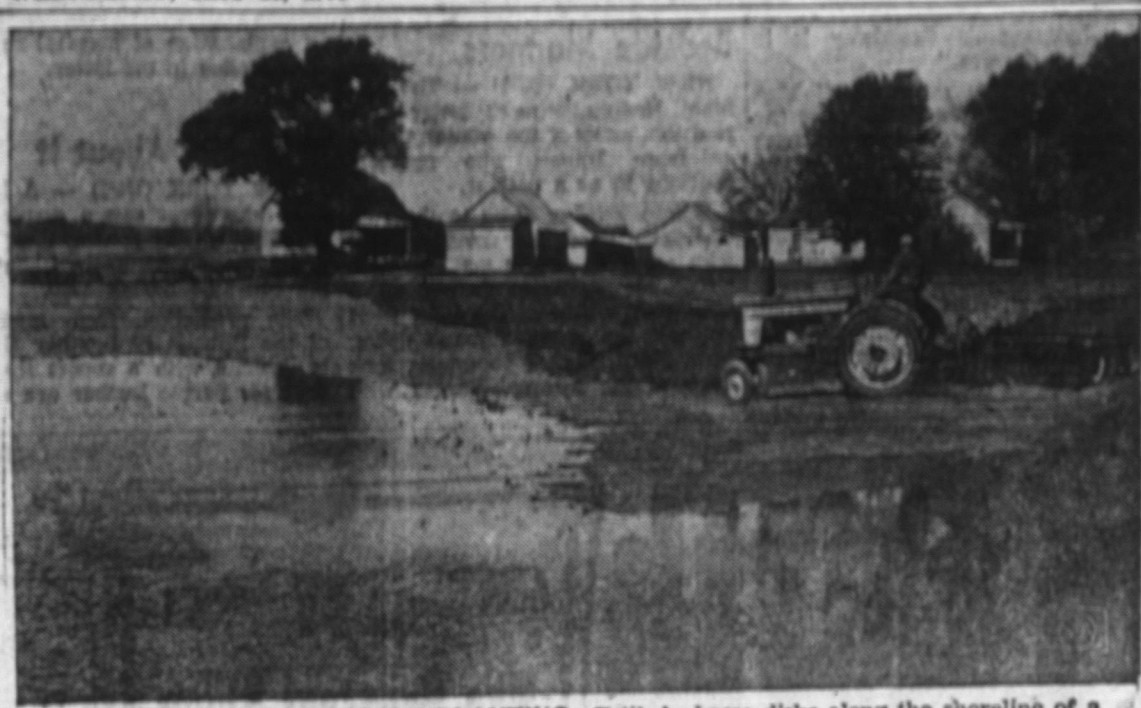
BETTER FOR FISHING THAN PLANTING —Etil Ambrose disks along the shoreline of a good-sized lake left by spring floods on his farm near Booneville in the Missouri River bottom. Large areas of land usually planted with corn by this time of year are still under water.