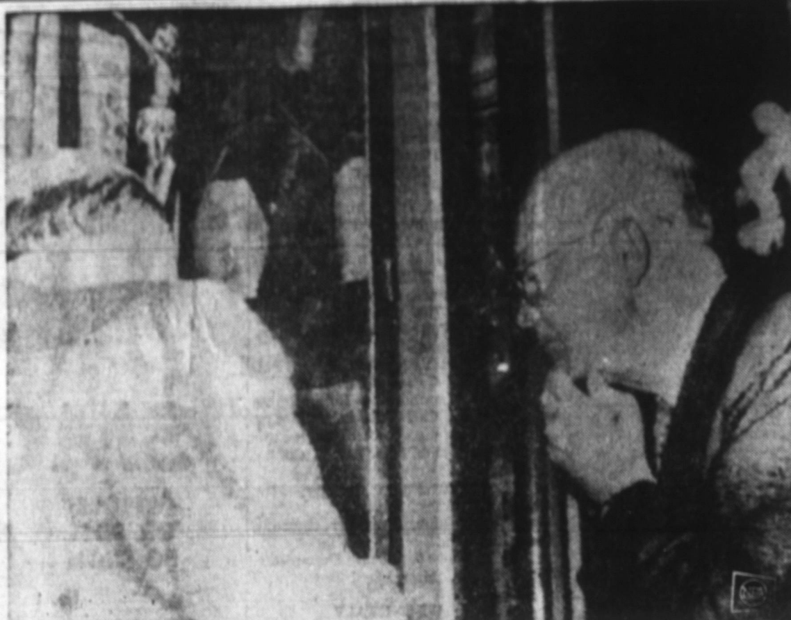
EISENHOWER AT NOTRE DAME—President Eisenhower takes time from summit duties to visit the 800-year-old cathedral of Notre Dame, Paris. The man at left is unidentified.

"Operation Petticoat" Sun. Mon. & Tues. at 9:15