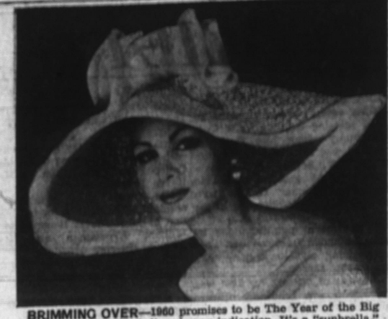
BRIMMING OVER—1960 promises to be The Year of the Big Hat if this New York item is any indication. It's a "umbrella."

5. Q—My wife and I have been receiving our social security payments in a combined check. However, now that she is in a nursing home, is it possible for us to get separate checks—one sent to me and one sent to my wife at the nursing home? A—Yes. Separate checks can be issued when you request it, and in all cases where it is burdensome or difficult for the payees to promptly negotiate their checks.