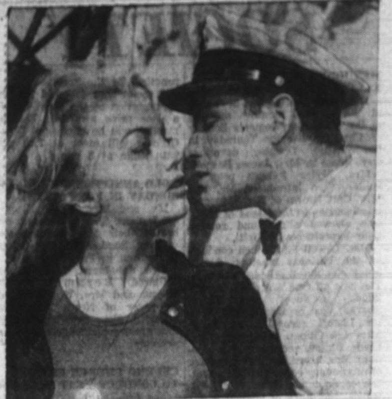
RIVAL FOR BARDOT—Imitation is . . . etc., and French actress Mylene Demongeot's posturings certainly flatter Brigitte. Mylene affects Mme. Bardot's long hair and her famous pout in the new Italian film, "Under Ten Flags." Mylene is shown, above, with John Ericson, who has the masculine lead.

Happy Hustlers club meeting, scheduled for this Tuesday evening, has been postponed until May 3. The meeting will be held in the home ec room of Adams Central school at 7 p.m.