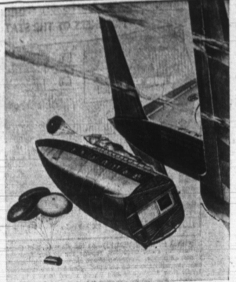
THE BIG DROP—Passengers of a disabled plane could be parachuted en masse in removable sections such as these. Two sections of an airliner's cabin, each holding half the persons aboard, would be escape pods with airtight doors and cargo parachutes. Emergency supplies would be included. The pods would be dropped, according to Mechanix Illustrated, in case of a sabotage bomb, collision, structural failure or fire.

Onions After dipping an onion into boiling water for a moment begin at the root and peel upwards. It will be found that this method does not affect the eyes.