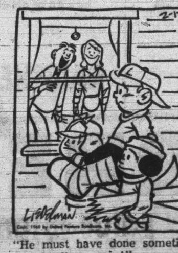
"He must have done something outstanding again!"