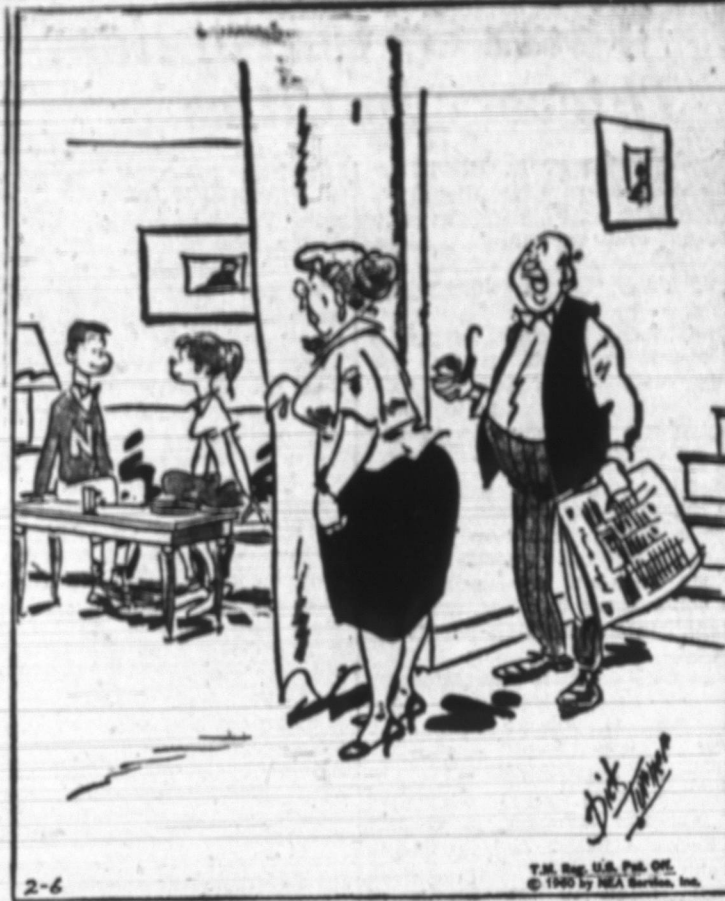
"He's everything we could want in a steady for Janie—intelligent, well-mannered and a vegetarian!"

MOVIES ADAMS "Warlock" Fri. 7:00; 9:30 Sat. 2:15; 4:45; 7:15; 9:45 "Return of the Fly" Sun. at 1:15; 3:45; 6:25; 9:15 "Alligator People" Sun. at 2:40; 5:20; 8:00; 10:35