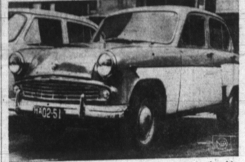
SOVIET'S COMPACT CAR—An American dealer has bought 10,000 of these Russian "Moskvich" sedans for the U.S. market, according to a Soviet report. The four-door, four-seater sells for $2,500 at the official rate of exchange. Its 45-horsepower engine carries it up to 72 m.p.h.