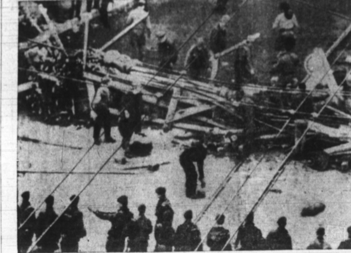
DOWN COME THE BARRICADES—French troops watch, bottom, as dismantling of street barricades begins in Algiers, in wake of collapse of the insurgents' stand.