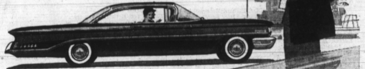
SUPER 88 HOLIDAY SCENICOUPE

What can there be in the styling of any automobile to make it stand out from all the others on the road? One look at a '60 Olds will tell you.