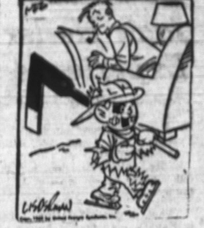
"The game hasn't started yet. We just chose sides!"