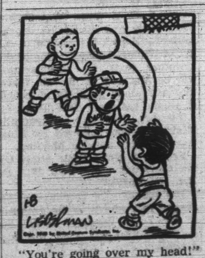
"You're going over my head!"

Pro Basketball Syracuse 132, Cincinnati 114. Philadelphia 120, Detroit 105.