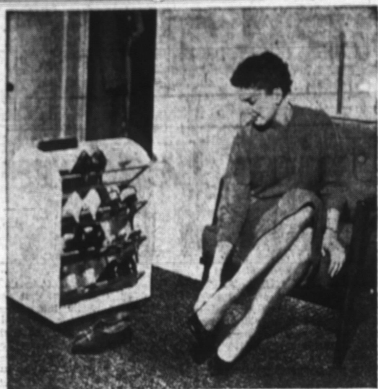
This young lady has the answer to the problem of jumbled footwear on the floor of the closet. This rolling shoe cart holds 24 pairs of shoes, is simple to build. Plan available.