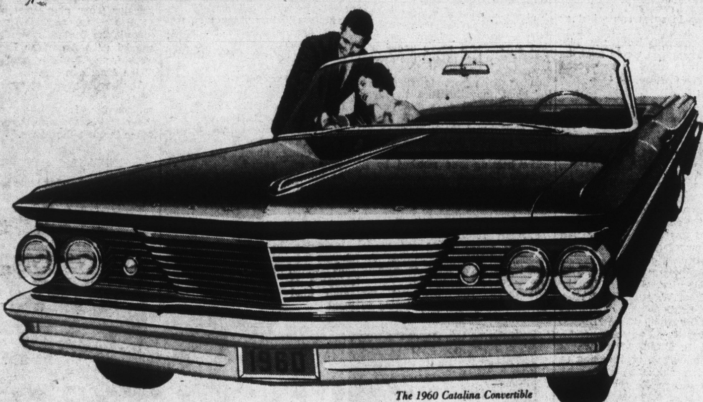
The 1960 Catalina Convertible

You find it attractive because of the simplicity of lines, the absence of over-design.