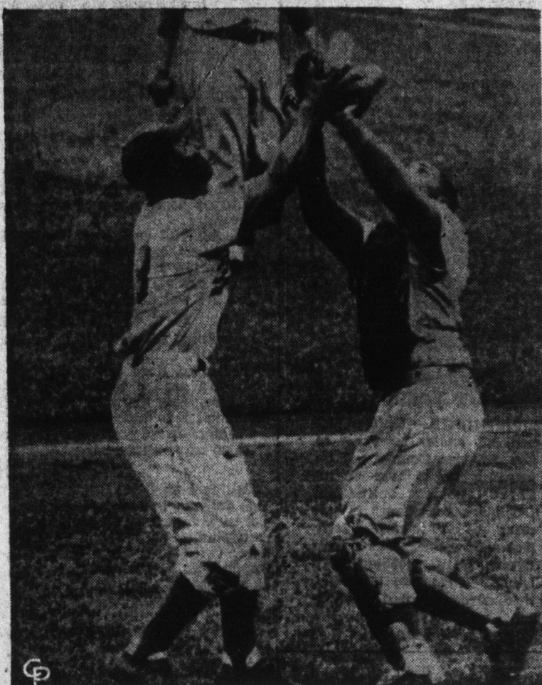
DODGERS DANCE FOR JOY —Los Angeles Dodger third baseman Jim Gilliam (left) and catcher John Roseboro appear to be prematurely dancing for joy as they collide in foul territory in an attempt to make a play on a pop foul off the bat of Andy Pafko of the Milwaukee Braves in the third inning of their National League playoff game at Milwaukee. Both the play and the ball game had a happy ending as Roseboro held on to the ball despite the collision and Los Angeles defeated the Braves, 3-to-2 on Roseboro's sixth inning home run to take the first of the three game series.

Los Angeles, however, squared the account in the third when