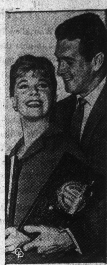
TOP MOVIE DRAWS — Doris Day and Rock Hudson are shown in Hollywood, Calif., after they were voted America's top movie stars for the second straight year. Motion picture exhibitors, representing 17,000 theaters in U.S., Canada and Europe, voted in poll conducted by The Exhibitor, a film trade publication.

Mashed Potato Biscuits 39c doz. Stewarts Bakery PHONE 3-2608