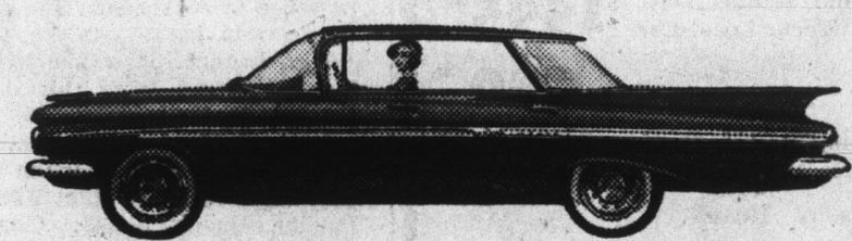
Now there's an Impala Sport Sedan . . . one of Chevy's full series of Impalas for '59

*National Automobile Dealers Association BEST ECONOMY . . . SOCK AWAY YOUR CHEVY SAVINGS As sure as two Chevy Sixes won their class in this year's Mobilgas Economy Run, getting the best mileage of any full-size car!