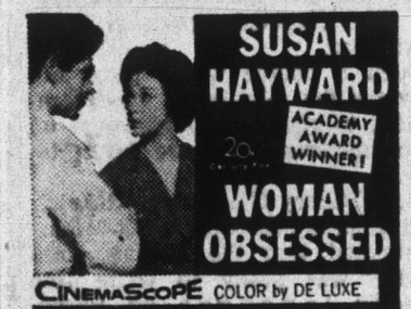
SUSAN HAYWARD ACADEMY AWARD WINNER WOMAN OBSESSED CINEMASCOPE COLOR BY DE LUXE In the words of HIGH FIDELITY STEREOGRAPHIC SOUND Fri. & Sat.—Forrest Tucker, "Gunsmoke in Tucson"—Color ALSO — "Juke Box Rhythm" Sat. Bonus—"Escort West" —O— Sun. Mon. Tues.—Debbie Reynolds "Say One For Me"—Color Bing Crosby, Robt. Wagner