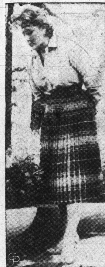
MODELING IN MOSCOW—Lirsa, a Soviet lass, models a knife-pleated wool skirt at the U. S. exhibition in Moscow.

The Indiana Office of Traffic Safety reports that one of the major causes of traffic fatalities and accidents results from motorists crossing the center stripe. During the month of August, with heavy vacation travel, it is well for motorists to heed the statewide warning to "Share the Road."