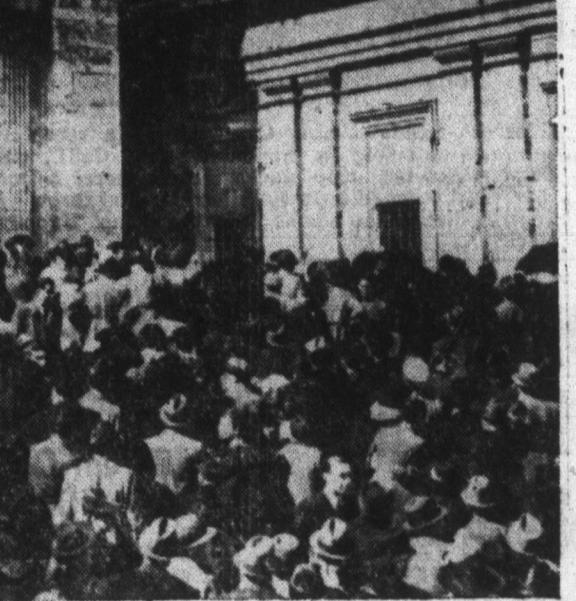
Black smoke issuing from Sistine chapel smokestack indicates ballot has been taken without a decision, white shows new pope has been elected.

THESE PHOTOS illustrate part of the official ceremony of electing pope in 1939, he became the 262nd pontiff of the Roman Catholic church. Pope is elected by College of Cardinals.