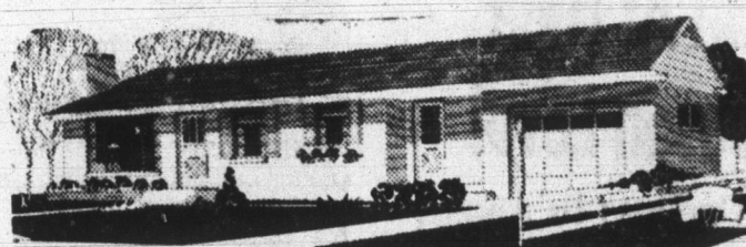
A SMALL HOUSE PLANNING BUREAU DESIGN NO. C-522

To obtain a smoother cut on glass, dip glass cutter into some kerosene or varnolene before each cut.