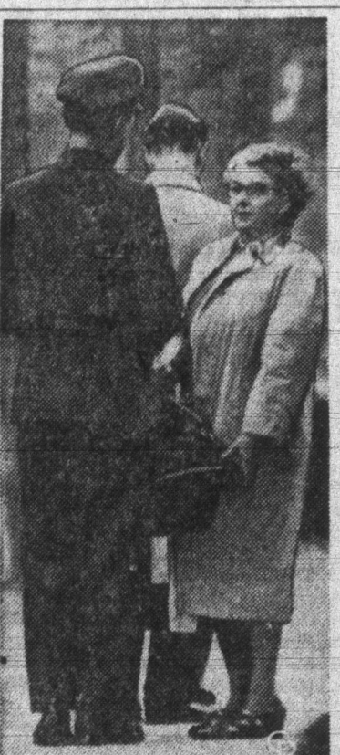
EAST BERLIN BARRIER — A woman shopper opens her handbag for an East German policeman before crossing into West Berlin as the Communists attempt to keep their marks at home. Persons crossing the border are searched to see that they are not carrying money out or bringing black market marks back with them.

More than 14 truckloads of fish were removed recently from Kunkel Lake, Wells county state game preserve, while it is being cleaned. The largest bass taken weighed ten pounds. Five spoonbill catfish, the largest measuring 5 feet, three inches in length and weighing 120 pounds, were taken, and two flat-head catfish weighing 60 to 70 pounds were taken.